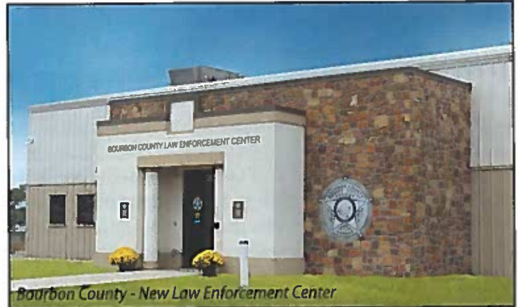
Bourbon County - New Law Enforcement Center