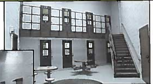
Bourbon County Above: Pod A Left: Dorm Housing