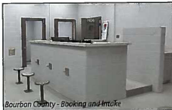
Bourbon County - Booking and Intake